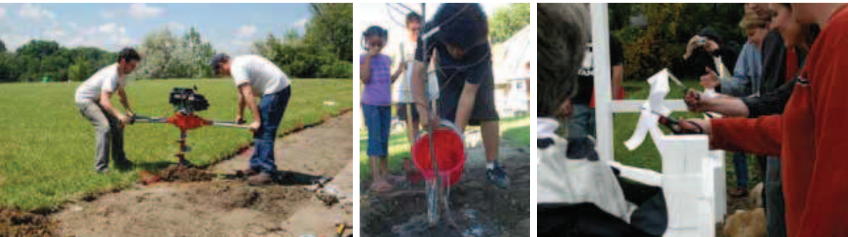
Brooklyn Centre Community Orchard