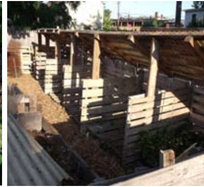
EcoVillage market garden